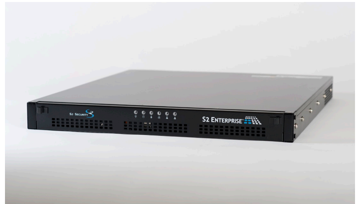
The S2 Enterprise (shown) and S2 Enterprise Ultra fit standard 19" racks

Two models are offered for maximum flexibility. The standard S2 Enterprise offers the benefits of higher processing speed, as well as increased device and user capacity in a value-priced package. The S2 Enterprise Ultra includes a faster processor and larger RAM array, and