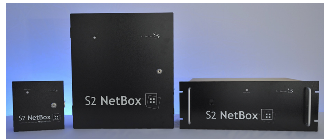
Several enclosure options are available for S2 NetBox systems.

Software for the entire system is embedded in the network controller. Updates are delivered online and completed in a single operation. Data storage is provided in flash ROM, removable compact flash, disk,